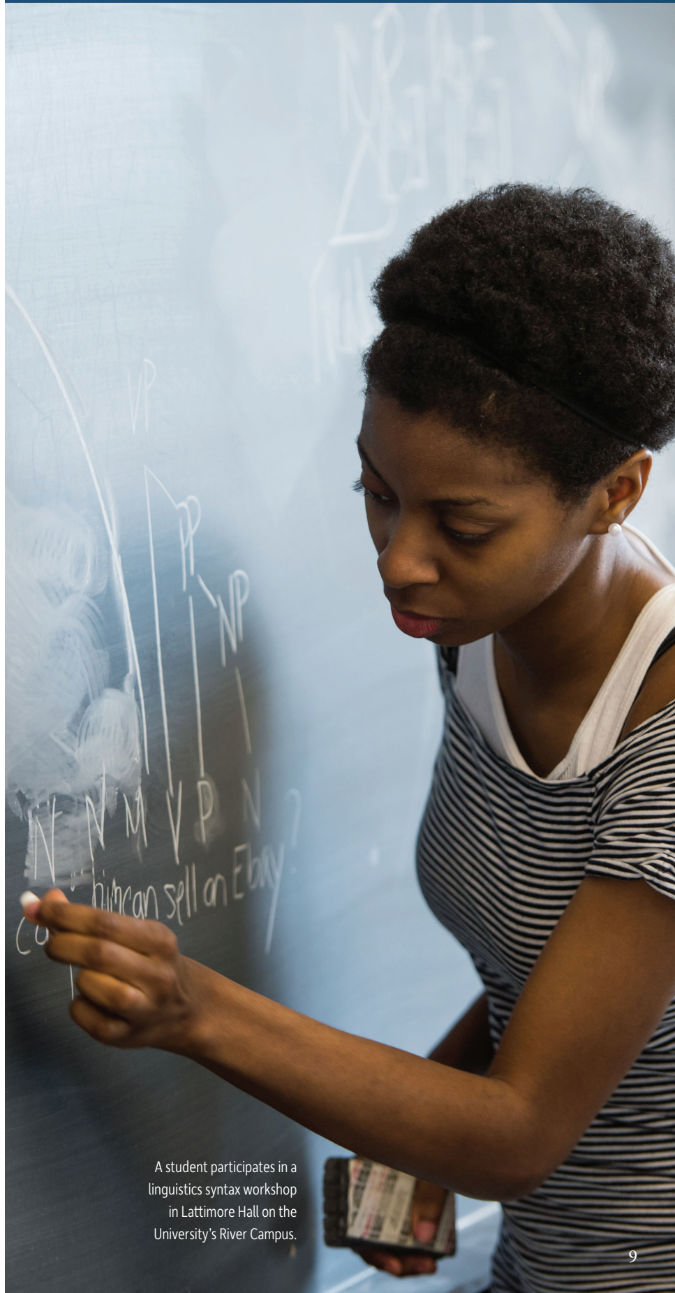
A student participates in a linguistics syntax workshop in Lattimore Hall on the University's River Campus.

Since 2007, the University of Rochester's Upward Bound programs have supported more than 300 low-income area high school students in an effort to increase the number of Rochester City School District (RCSD) students who apply and gain admission to college. The program has a 96 percent high school graduation rate, with 90 percent of students continuing on to pursue a higher degree.