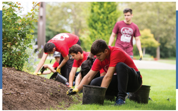
First-year students set off to volunteer in the Rochester community on Wilson Day in September 2017.