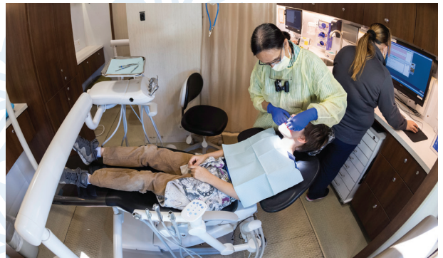
Eastman Institute for Oral Health's SMILEmobile, a self-contained traveling dental clinic that allows for disabled access, pays a visit to East High School in October 2017.