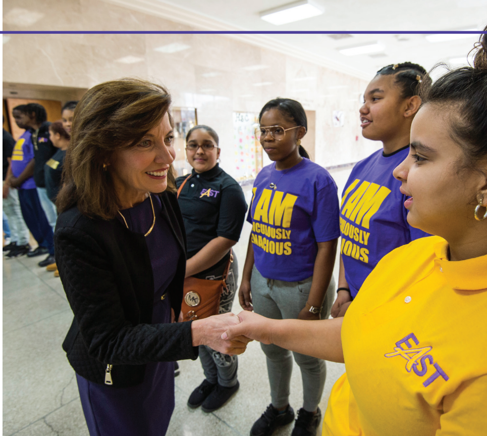
New York State Lieutenant Governor Kathy Hochul meets students on a visit to East High School in February 2017.

1,350 students at East and families in the surrounding neighborhood. In June 2016, the Eastman Institute for Oral Health conducted approximately 300 dental screenings for East students.