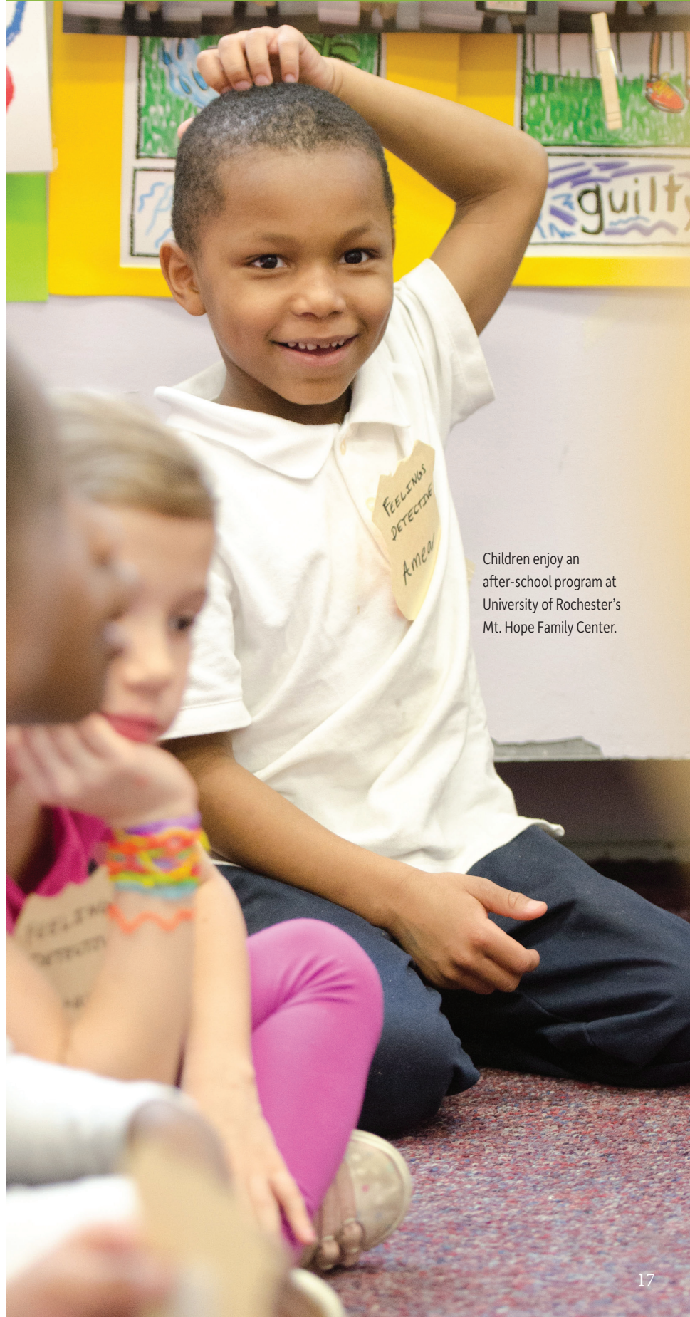
Children enjoy an after-school program at University of Rochester's Mt. Hope Family Center.

Mt. Hope Family Center provides prevention/ intervention programs and proven therapy to more than 900 local children and families each year.