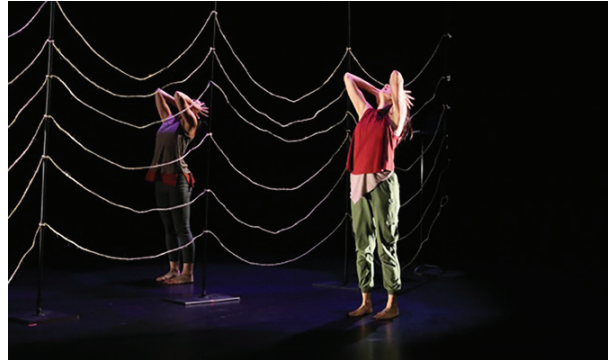
Students and faculty from the Program of Dance and Movement join other colleagues from across the University to perform at the KeyBank Rochester Fringe Festival in September 2016.