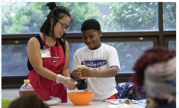
Educators from the University of Rochester's Center for Community Health demonstrate how to prepare healthy meals during a Family, Food, and Fun program at Southeast Towers in October 2017.