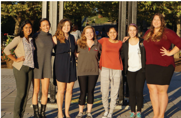
UR HEAL, a student organization that provides health care services to low-income Rochester community members, was chosen as the first-ever recipient of the Rochester Center for Community Leadership's Community Engagement Challenge grant in April 2017.