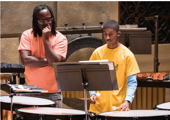
The Gateways Music Festival, honoring classical musicians of African descent, presented more than 50 free performances in concert halls and community venues throughout the Rochester area during its inaugural year in 2017.