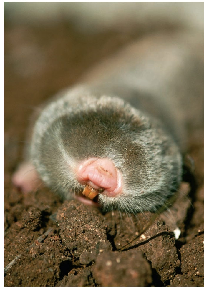
SWEPT CLEAN: Blind mole rats have a unique biological mechanism that sweeps abnormal cells and nearby cells from their bodies.