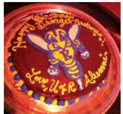
RED-HOT ROCKY: The University mascot atop the Philadelphia cake

For the third year in a row, the Young Alumni Council and the Office of Alumni Relations teamed up during the week of July 12—the birthday of George Eastman—to sponsor birthday parties for George around the country. This year, alumni marked the 159th anniversary of Eastman's birth with 12 parties in New York City, Boston, Chicago, Baltimore, the Twin Cities, Los Angeles, Washington, D.C., Pittsburgh, Philadelphia, West Orange, N.J., and Rochester.