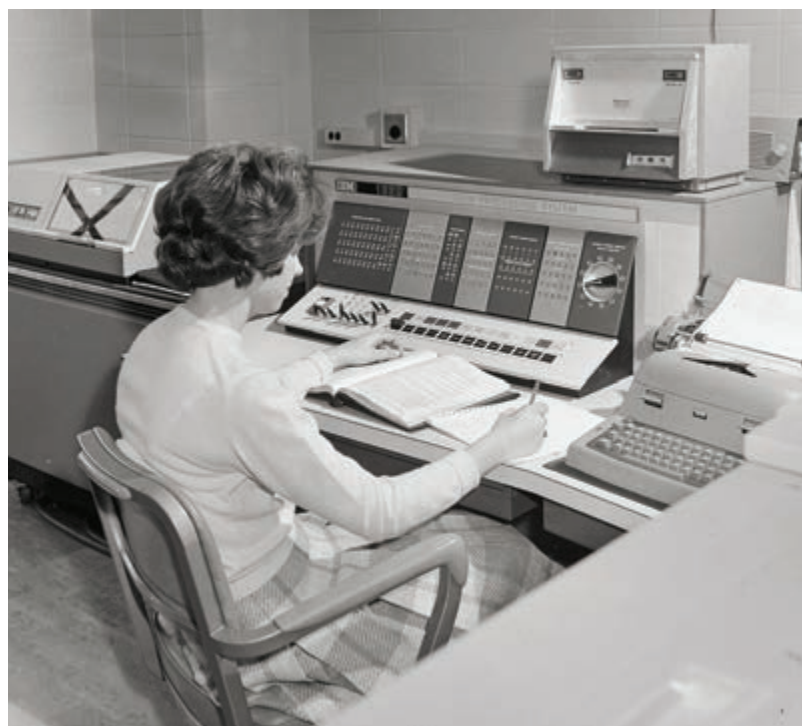
COMPUTER AGE: The University established its first computer center with a single desk-sized machine in 1955. The center was upgraded a year later and again in 1961 to keep pace with changing technology.