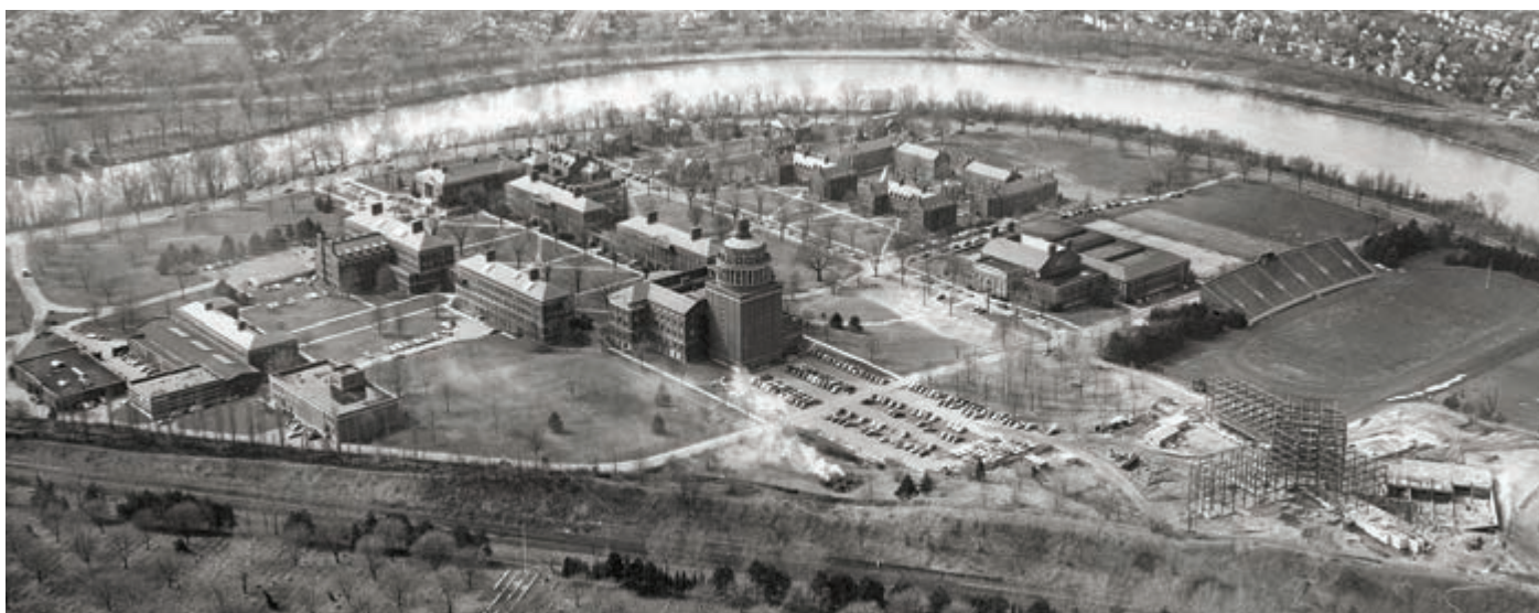
ICONIC HOME: Construction on a residence hall for women began in the early 1950s (above) in preparation for the move of the women's college to the River Campus.

four miles from the River Campus, and our physical separation kept us from being entirely drowned in the Genesee.”