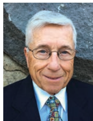
W. Archie Bleyer