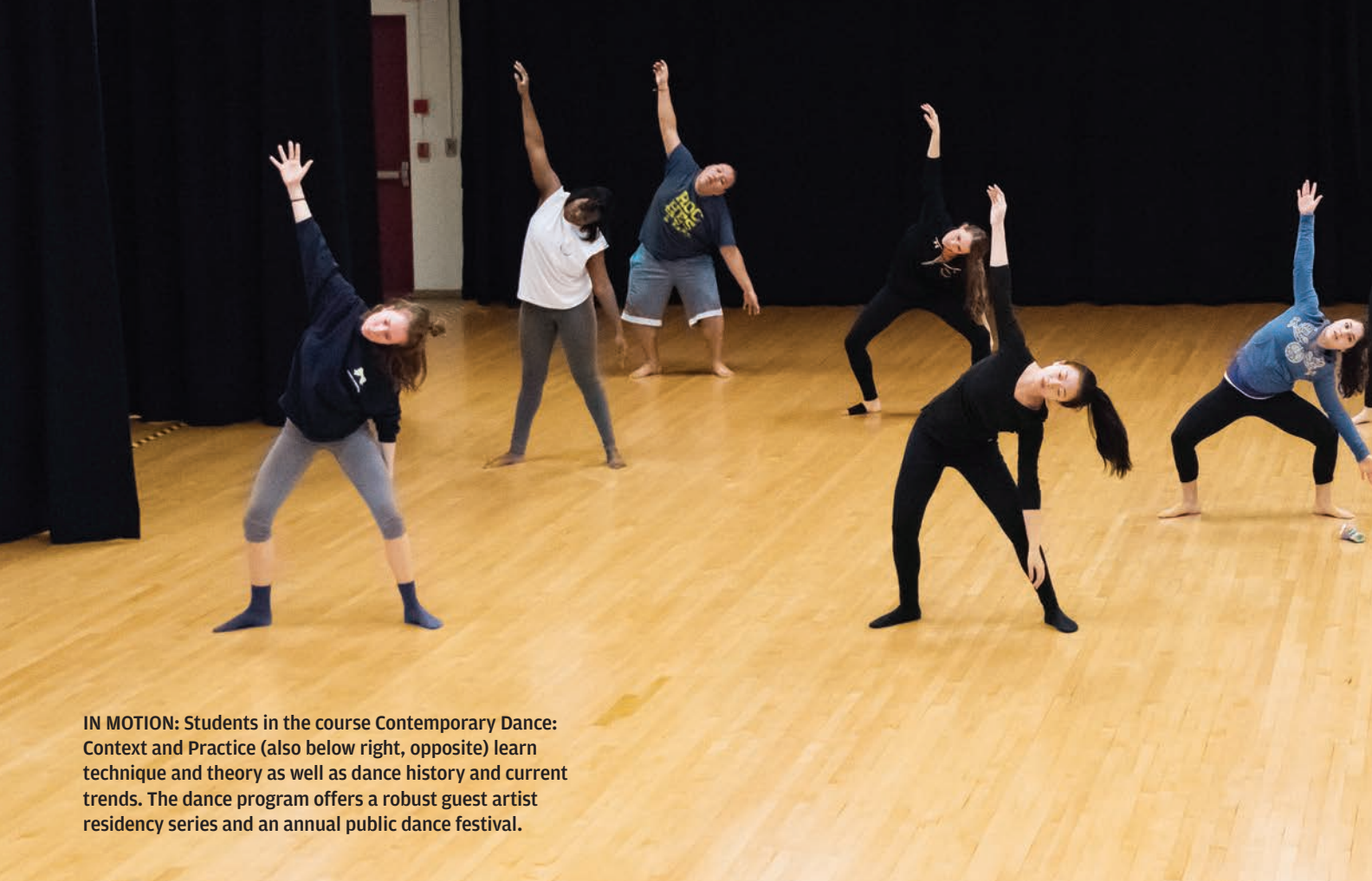
IN MOTION: Students in the course Contemporary Dance: Context and Practice (also below right, opposite) learn technique and theory as well as dance history and current trends. The dance program offers a robust guest artist residency series and an annual public dance festival.