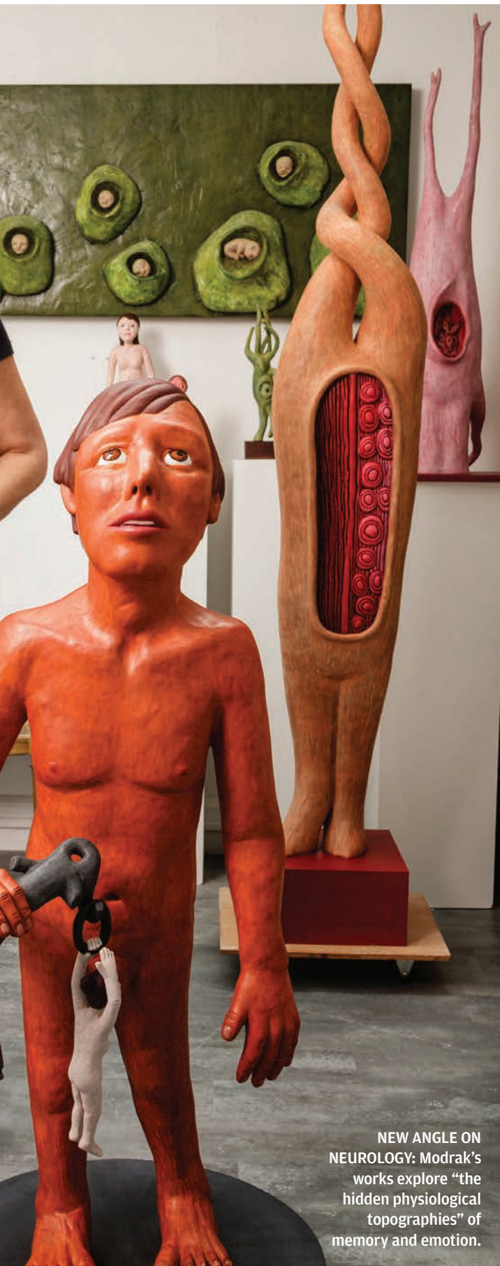
NEW ANGLE ON NEUROLOGY: Modrak's works explore "the hidden physiological topographies" of memory and emotion.