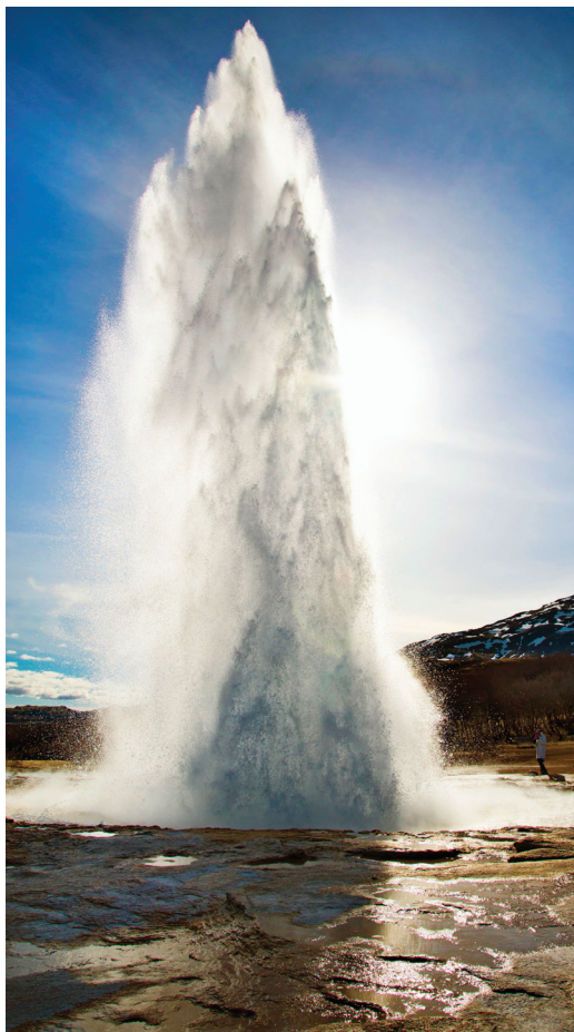
Iceland's hot spring geysers are famous natural attractions.

Day 11: Depart for U.S. Today we depart for the airport and our return flights to the U.S. B