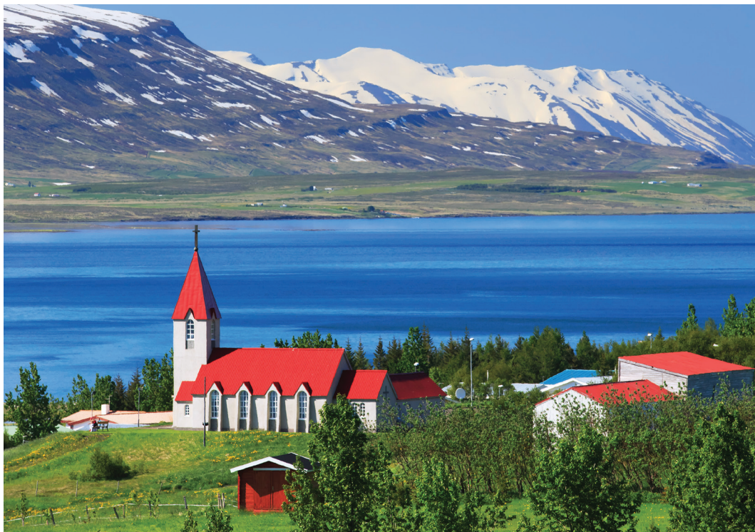
Iceland's landscape reveals an austere beauty.

the labyrinth of “echoing rocks” created by the spiral basalt formations of the arches and canyons here. Our last stop: jaw-dropping Dettifoss, Europe’s most powerful waterfall and Iceland’s “Niagara.” B,L,D