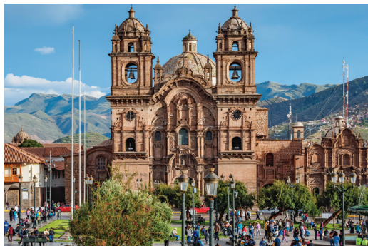
Cuzco, UNESCO site and former Inca capital

Day 11: Arrive U.S. We arrive in the U.S. this morning and connect with our return flight home.