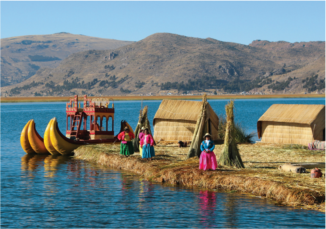
Local women on Uros Island

through the ruins and have the leisure to absorb the beauty and mystery of this haunting UNESCO World Heritage site. Mid-afternoon we return to Aguas Calientes and our hotel, with time at leisure before dinner together tonight. B,L,D