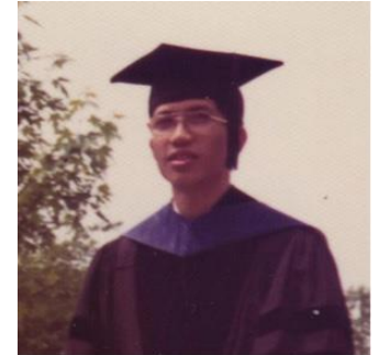
1973 UR Graduation