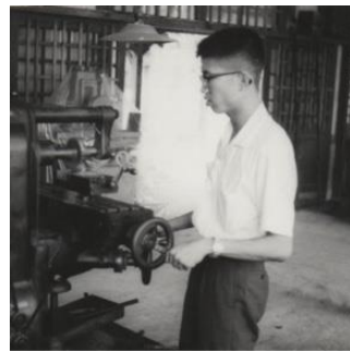
1965 NTU Machine Shop