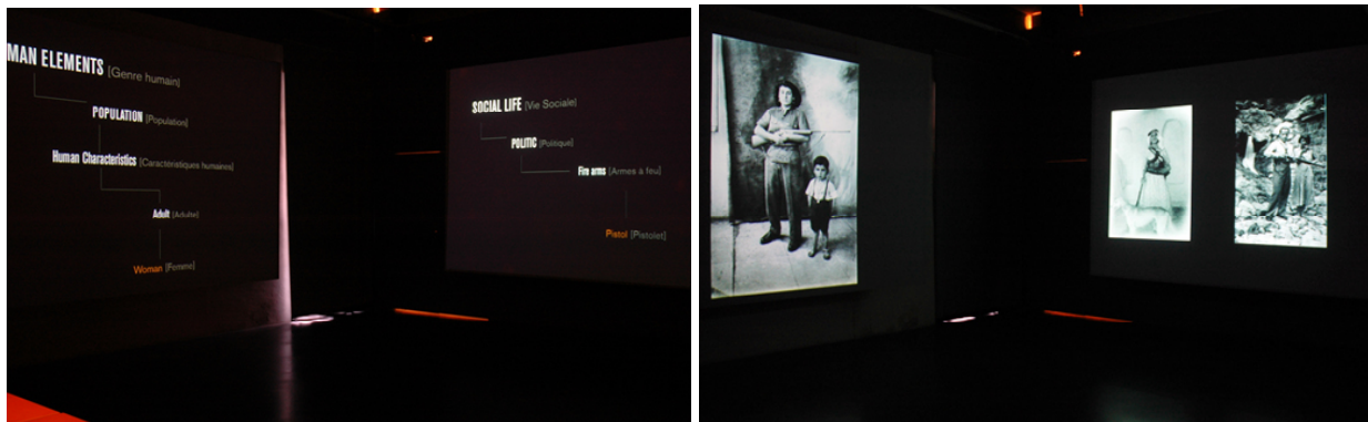
Soit dit en passant , Installation View, Marseille (2005-06)