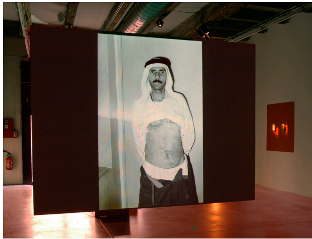
Soit dit en passant , Installation View, Marseille (2005-06)

The terms added and deleted by the Foundation indicate the slant of the Foundation itself. The woman in charge of this project, Tamara Sawaya, alters this system bit by bit as she sees fit. When a photograph defies description a new term is added. When a term is not useful it is deleted. In Not Given the images filed under added keywords are projected on two adjacent screens in the first room. In the second projection room, images that fall under keywords that express emotion or gesture are doubly accessed with either the keyword man or woman , and these gendered groupings are projected on opposing screens. The most striking examples in this group are terms that yield nothing. For example, caressing + man yields no images, and grimace + woman likewise. Under undressed + man only one image emerges—a man reveals his scar to the camera—while the opposite screen features numerous images, many of scantily clad women from the studio of Van Leo, a Cairo photographer whose luscious retouched images depict women as if they are Hollywood stars with the appropriate lighting, backdrop, and effects. Following the logic of this system, it seems that women do not grimace or flex and men do not caress. Do men undress? Only to reveal their wounds, apparently.