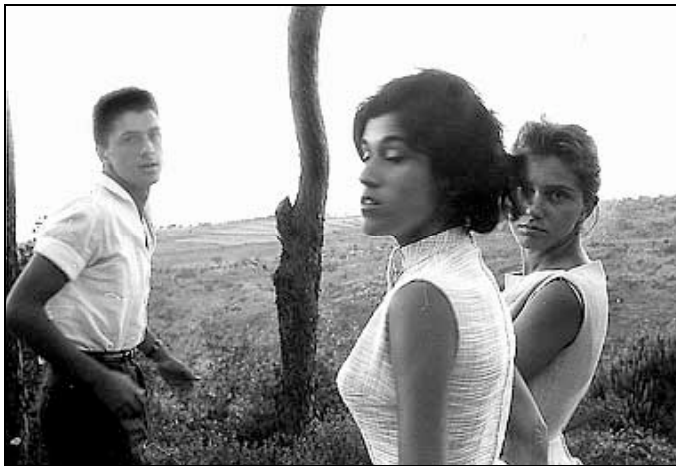
0088kh00087 Outing around Chekka Lebanon/Chekka, 1960 Keywords: Glance; Young man; Young woman; Plain Genre: Snapshot Photographic process: Positif/black & white/support papier DOP-Papier a developpement à la gelatine Size: 6.50 * 9.30 cm Aspect Ratio: 1.43 Condition:

Youth, summer, Lebanon, countryside outing, 1960. All of these rest in my imagination as if caricatures, thereby calling forth new caricatures. And the danger of imagination is that, indeed, it generalizes. As Sartre writes of the mental image, it “teaches nothing.” 10 Since we already know what we will find in imagination (since nothing new is discovered), it is the exact opposite of an encounter with objects and people in the variable world of perception. It is a variety of stereotype. And yet we begin a journey with an image already in mind, and we return home with pictures in hand. Imagination and perception are intertwined and act upon each other. Vilém Flusser describes this looping structure thus: “Images signify—mainly—something ‘out there’ in space and time that they have to make comprehensible to us as abstractions (as reductions of the four dimensions of space and time to the two surface dimensions). The specific ability to abstract out of space and time and project them back into space is what is known as