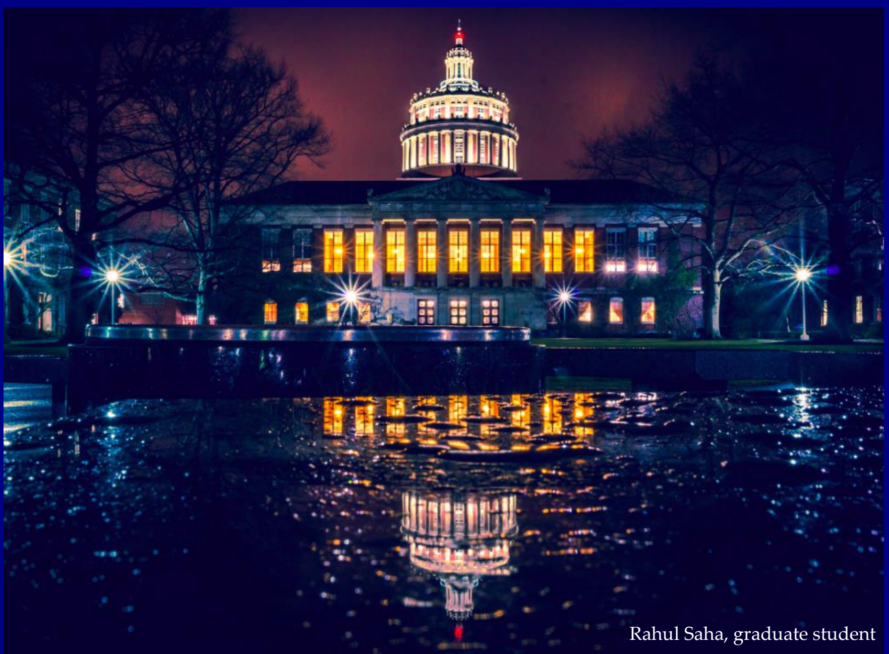
Rahul Saha, graduate student