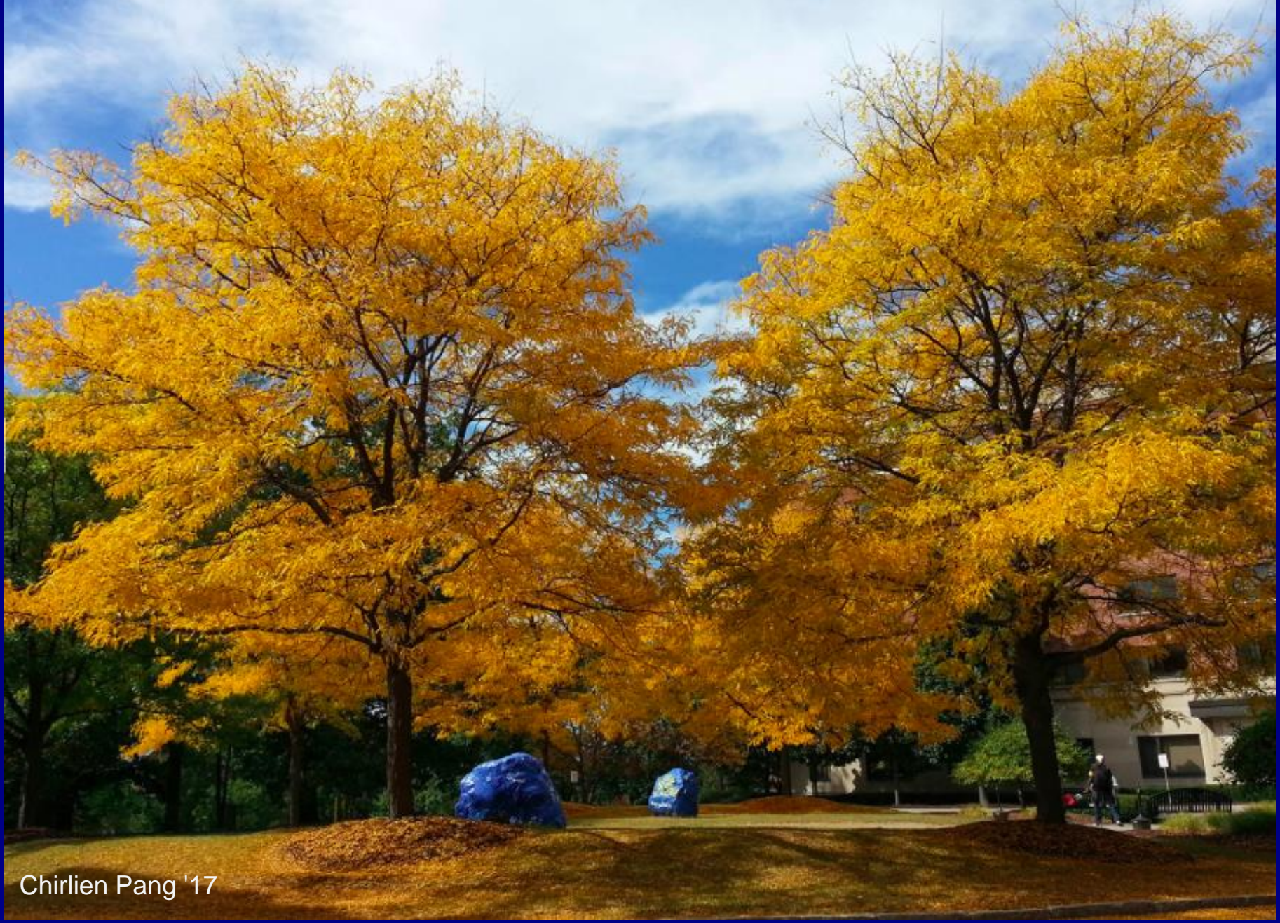
Chirlie Pang '17