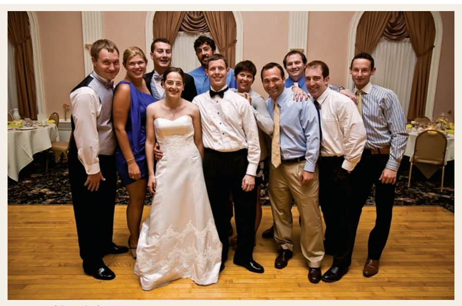
2004 Smith and King