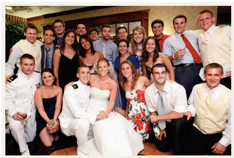
2009 Robinson and Socash