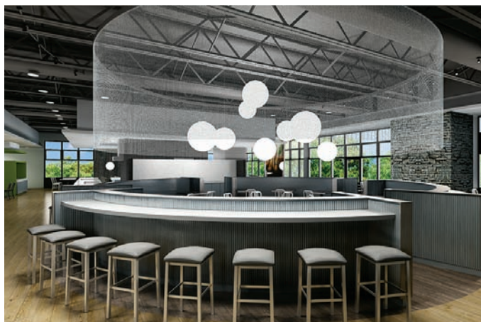
BEFORE & AFTER: The current dining area in Danforth (above, top) will be replaced with a sleek space that melds cooking and dining, as shown in an architect's rendering (above), designed to let students see the preparation of their meals.

things in person, and develop products specifically for campus customers. And we've seen some local bakeries hire more workers from the community to keep up with the increased demand."