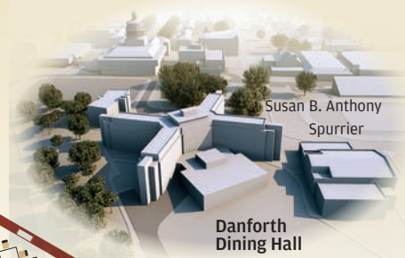
Danforth Dining Hall

Renovations to campus dining facilities this summer include a new design for Danforth Dining Hall (right) and a new campus market, the “POD” (short for “Provisions on Demand”).