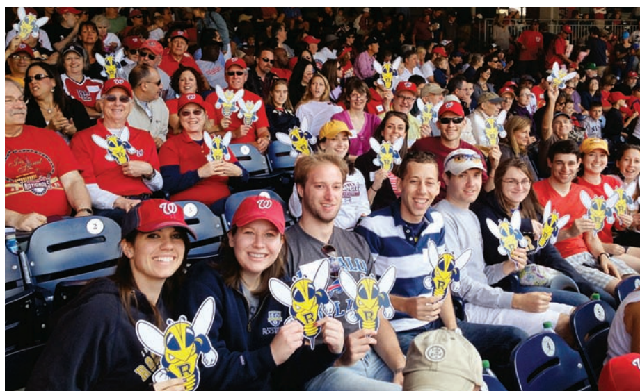
With more than 100 Washington, D.C., area alumni in September at a game between the Washington Nationals and the Milwaukee Brewers.