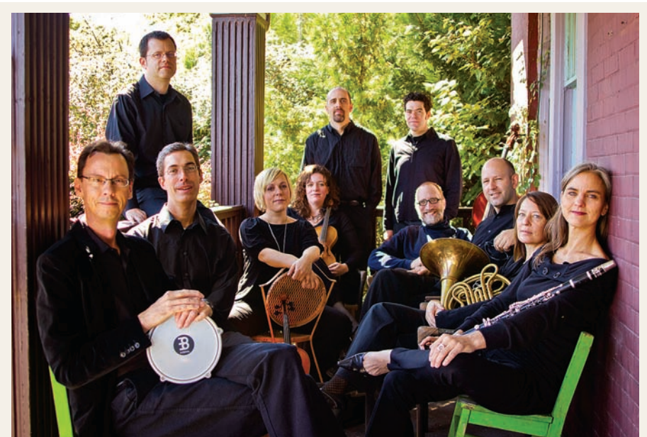
HOT IN TENNESSEE: Nashville's Alias Chamber Ensemble, which includes four Eastman alumni, has won accolades for its innovative repertoire as well as for its service to the community.

Not surprisingly, another key issue will be civil unions. He plans to reintroduce the bill on day one of the new session. ②