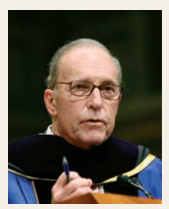
Lawrence Kudlow '69