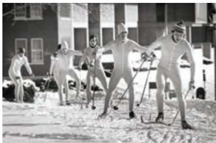
SKI-A-THON: A 1986 photo shows the cross-country ski team during a fundraiser.