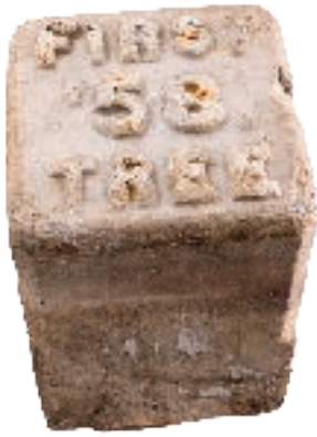
LASTING MARK: A marble marker is all that remains of the Class of 1858 gift for the Prince Street Campus.