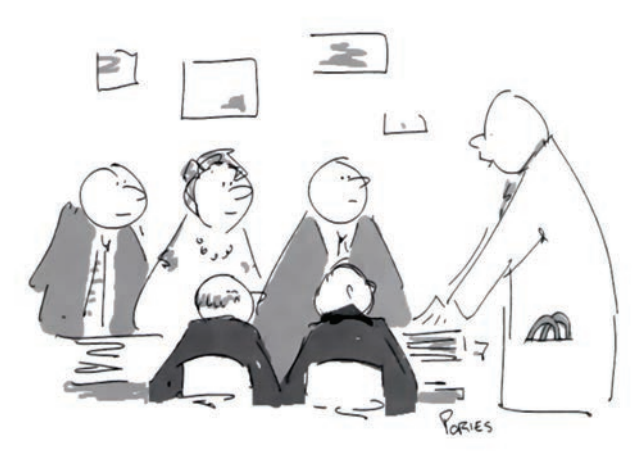
"My faculty agrees with you that we need to run this center like a business. Accordingly, we voted to shut down the medical school and invest the reserves."