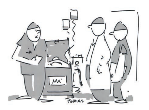
"After the lab studies, angiograms, MRI, and the full body CT scans, the physical examination revealed the knife in his back."