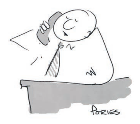
"Yes, you are fully insured." "Yes, we require six months of consecutive visits for dietary control prior to bariatric surgery even though the NIH has found it not useful." "No, of course we don't pay for these visits."