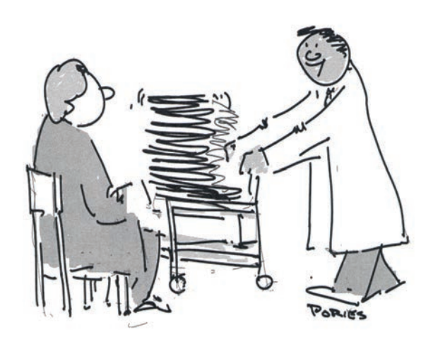
"Thanks again, Virginia, for continuing in our study. We have just a few new forms to complete ..."