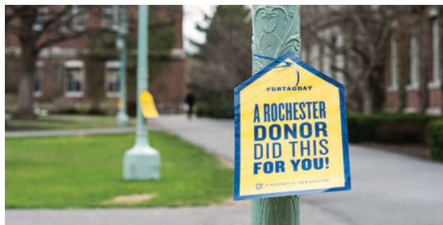
APPRECIATION: Tags highlight the tangible impact of givers.

For more about the day’s events, including photos, social media, and other information, visit www.rochester.edu/giving/dayofgiving .