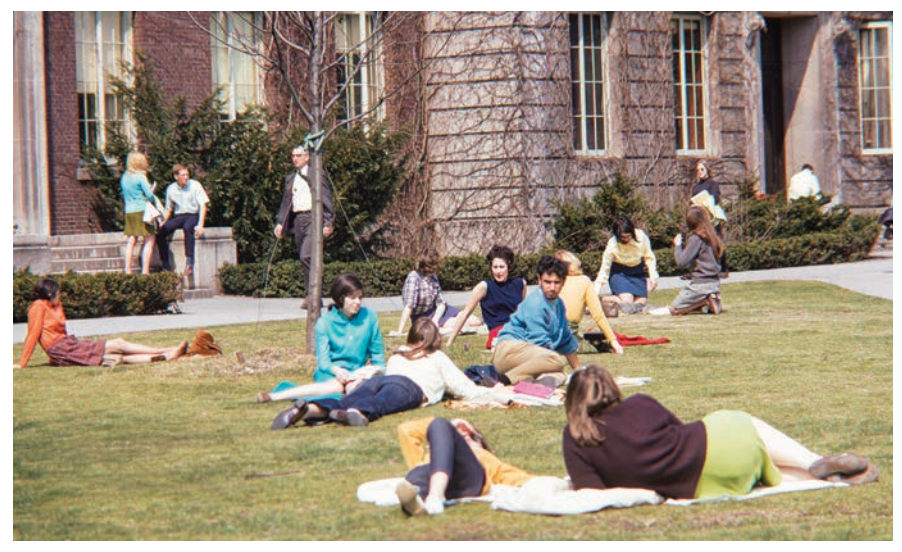
WHO'S WHO? Classmates help put names to faces in a historical photo.