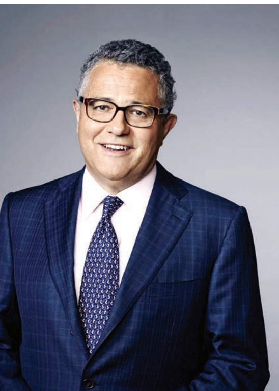
HOLDING COURT: Legal analyst Jeffrey Toobin (left) will join noted attorney and broadcaster Arthur Miller '56 for this fall's Miller's Court, a freewheeling discussion of legal issues that Miller has moderated annually during the weekend.