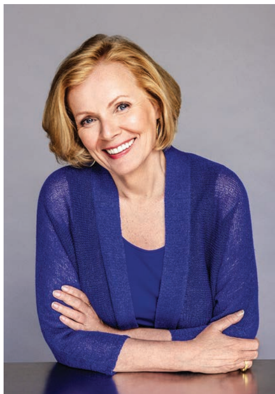
PRIZE COLUMNIST: The Wall Street Journal's Peggy Noonan (right), who won a Pulitzer Prize this spring for her coverage of the 2016 presidential election, will offer her take on the state of American politics and political leadership.