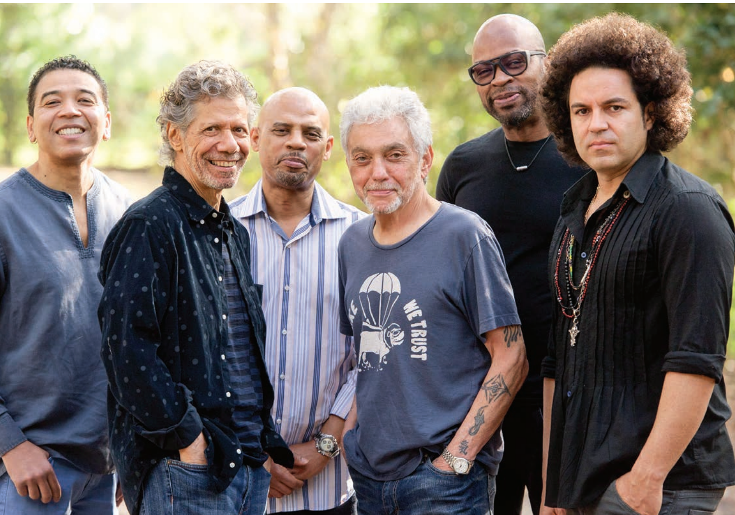
STAGE DEBUT: Jazz great Chick Corea and noted session and studio drummer Steve Gadd '68E will lead a band together (above) for the first time when they perform in concert on the stage of Kodak Hall at Eastman Theatre.