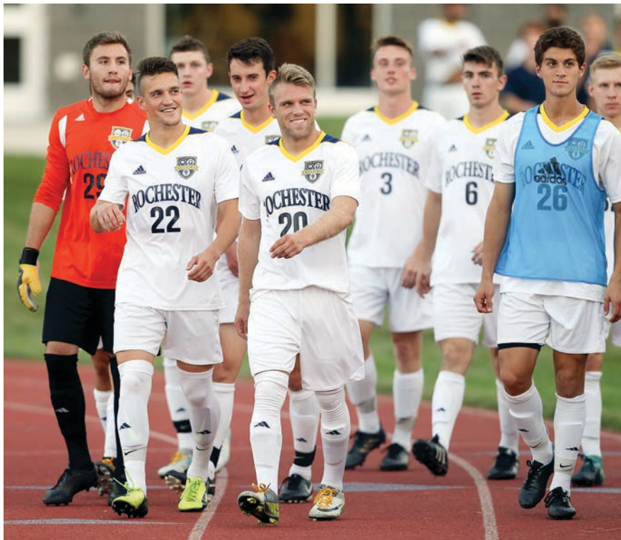
TOURNAMENT TESTED: For the fifth time in the past six years, the men's soccer team received a bid to the NCAA Division III tournament.