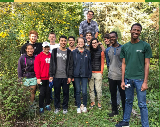
Students engaging with Community leaders at an Urban Food Forest.

“EcoReps has been an amazing opportunity for me and has opened a number of doors. From community partners to administration, I have gained a number of resources which have helped me in every aspect of my academic career.”