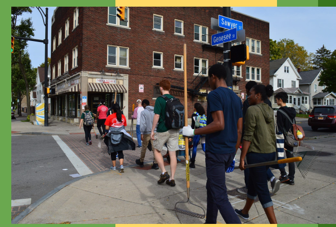
Going to Wilson High School