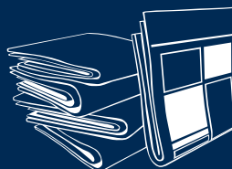
Newspaper & inserts