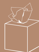
Tissues, napkins & paper towels