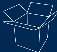
Clean & flat cardboard boxes