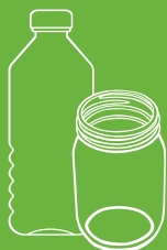
Bottles, jugs & jars

All containers must be emptied and rinsed with caps unattached