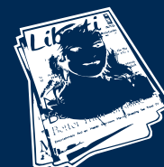
Magazines & catalogs