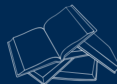
Books (hard & soft cover)