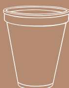
Styrofoam (all kinds)