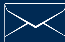
Mail & envelopes