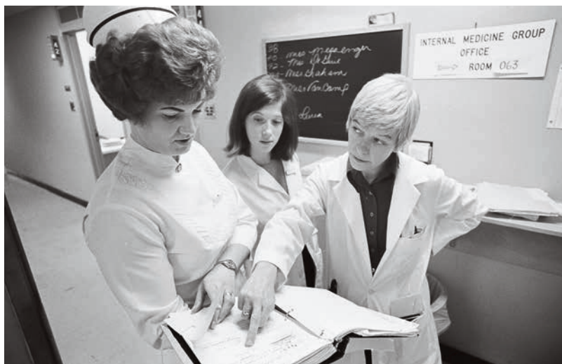
NEW MODEL: First introduced in 1965, the role of nurse practitioner brought together practice and education in a way that has helped transform health care.